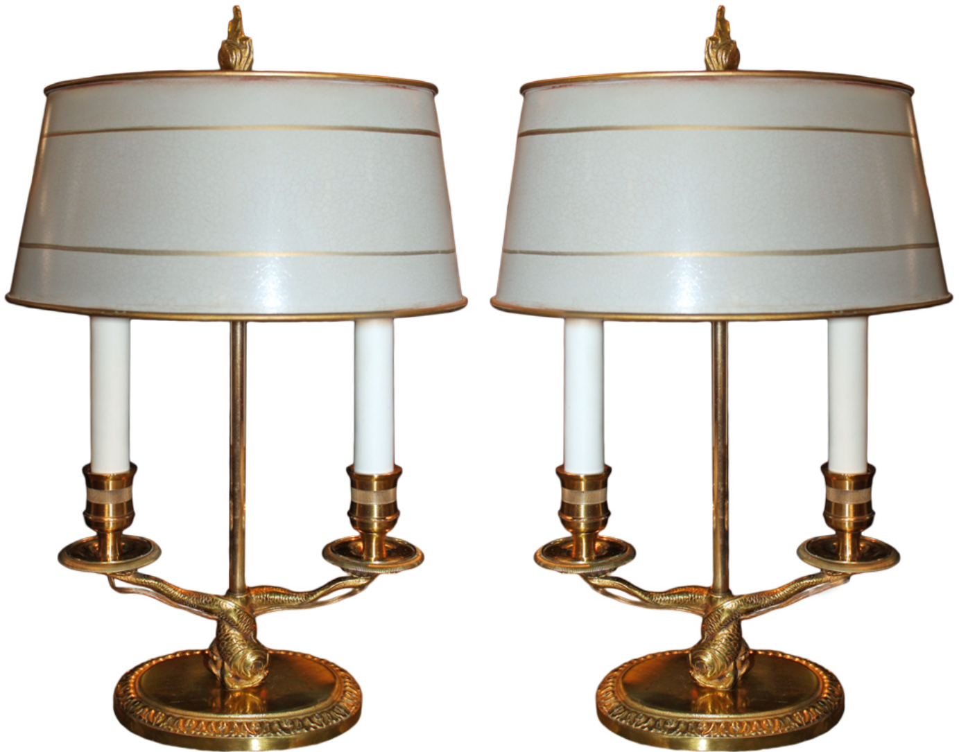
France 1660 M0058