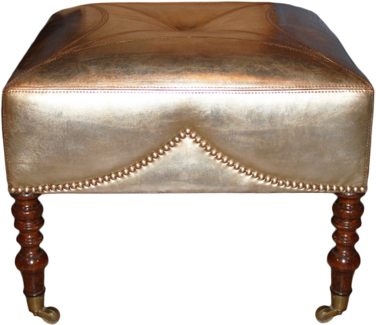
Anglo-Indian 4940 C00052