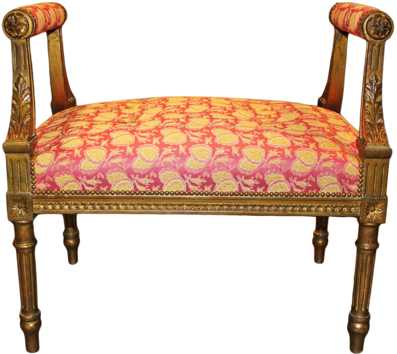
Anglo-Indian 4940 C00052