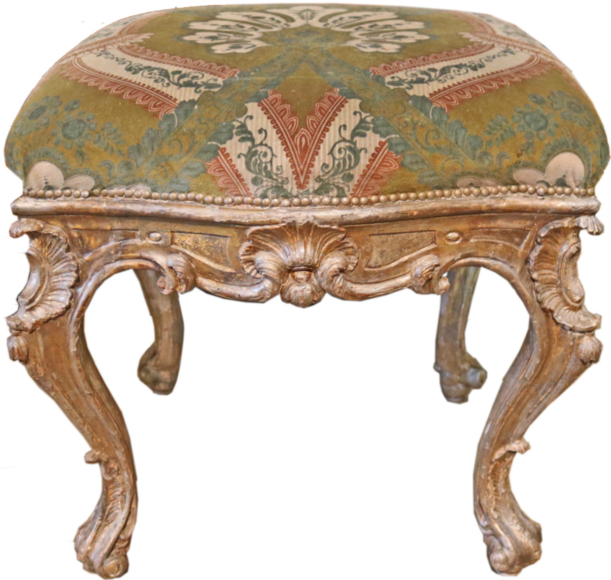
Anglo-Indian 4940 C00052