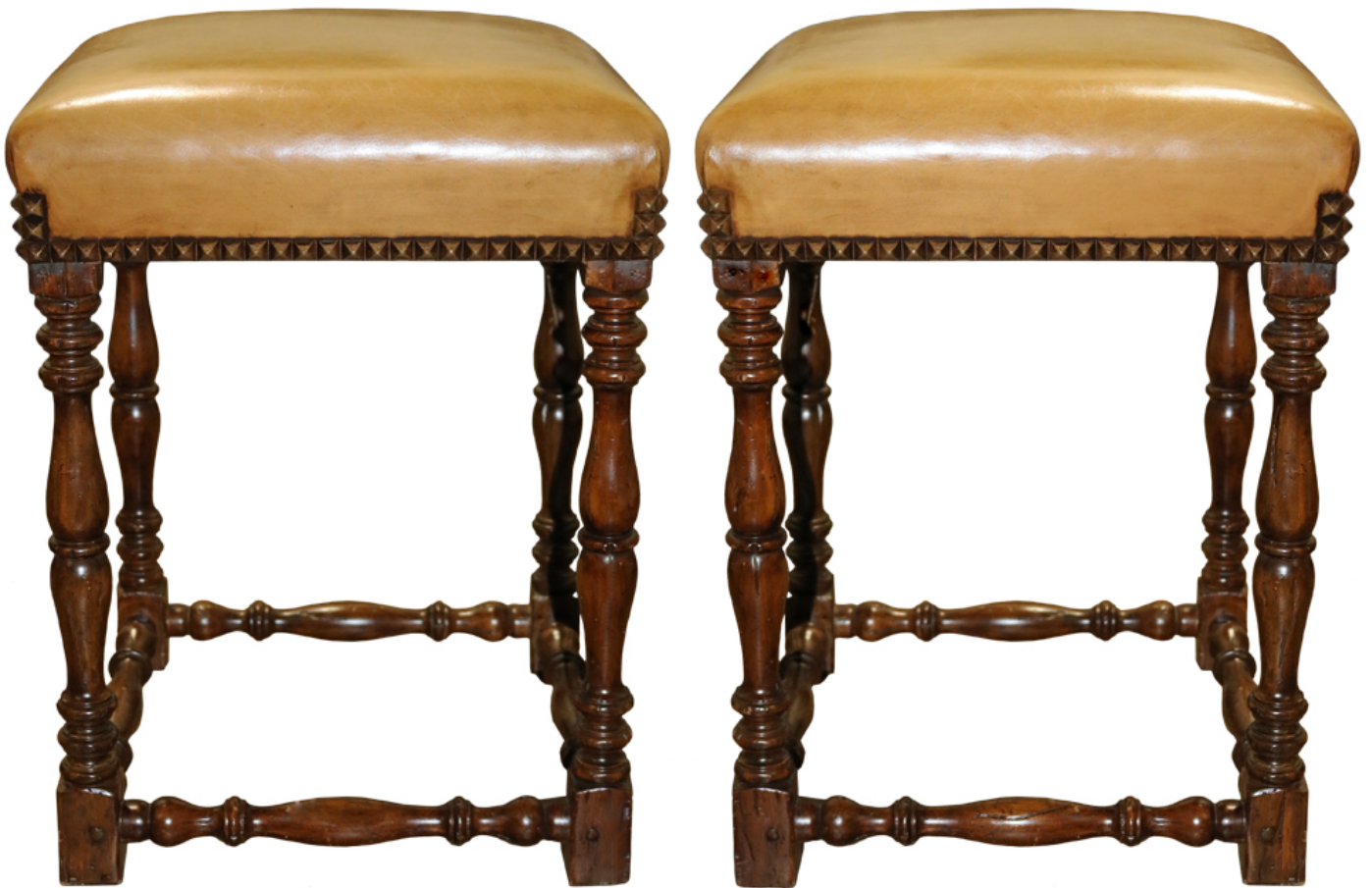
Anglo-Indian 4940 C00052